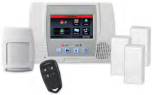
FRIENDS AND FAMILY SKU #: L5000-FFB