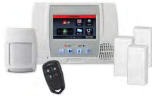
FRIENDS AND FAMILY TOTAL CONNECT SKU #: L5000-FTC