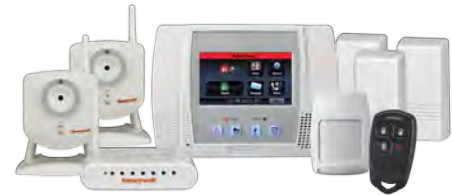
FRIENDS AND FAMILY PLUS VIDEO SKU #: L5000-FFV